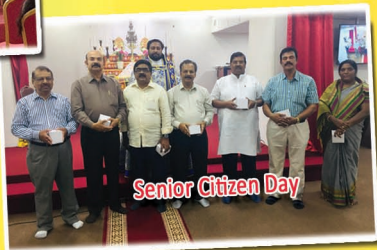
Senior Citizen Day