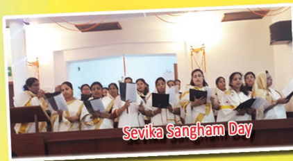
Sevika Sangham Day