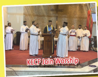
KECF Join Worship