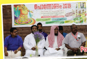
Ponnadam - 2019