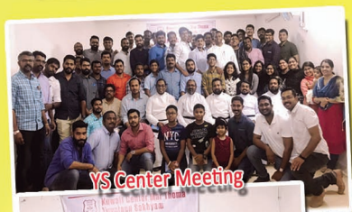
YS Center Meeting