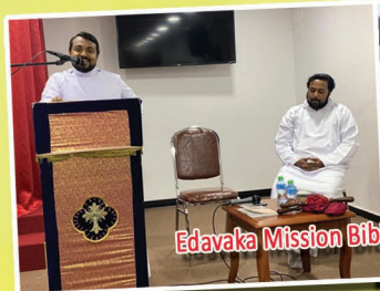
Edavaka Mission Bible Study