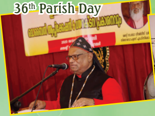
36 th Parish Day