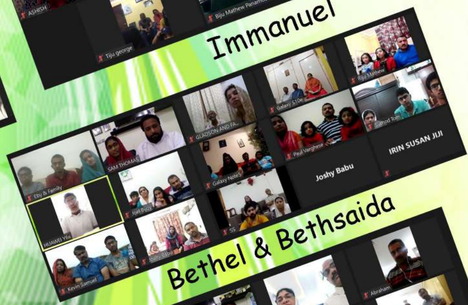
Bethel & Bethsaida