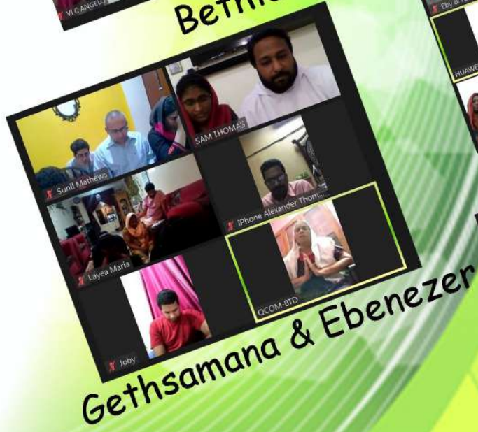
Gethsamana & Ebenezer