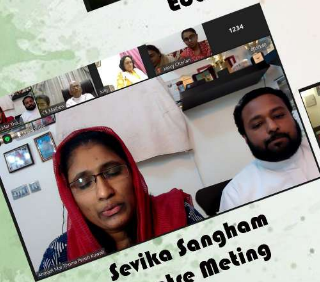
Sevika Sangham Centre Meeting